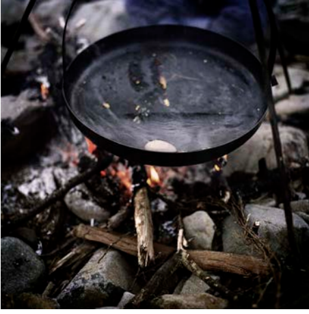
Sarah Rhodes The first rhythm they became used to was the slow swing from dawn to quick dusk 2011