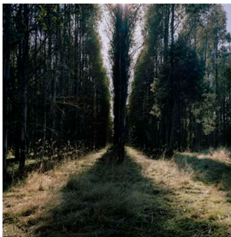
Sarah Rhodes Now the antagonism was audible 2011